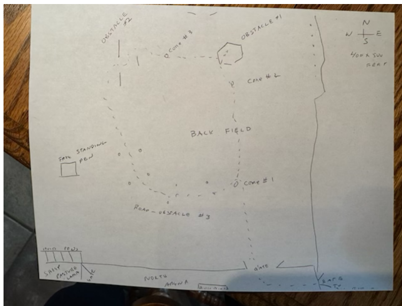
Back Field Map